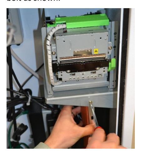
Ensure the thermostat is orientated at the bottom of the heater element.

3. Attach the heater element to the printer mounting plate with a nut and bolt as shown.